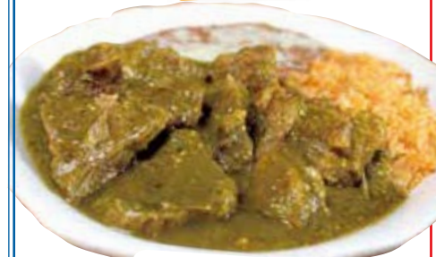
CARNITAS EN SALSA VERDE