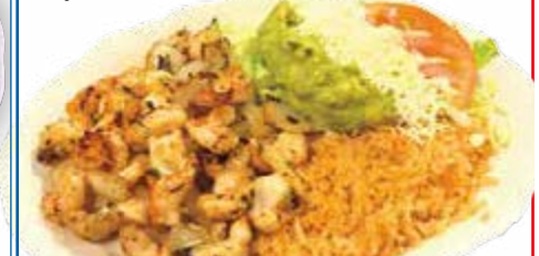
CAMARONES AL MOJO DE AJA