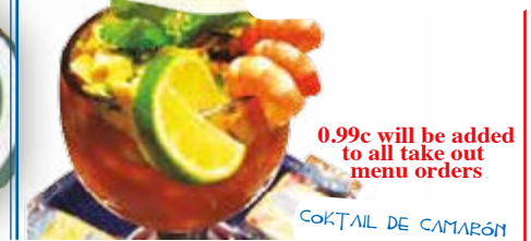
0.99c will be added to all take out menu orders