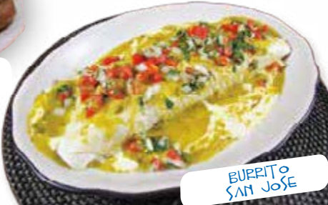
BURRITO SAN JOSE