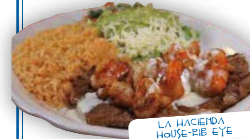
LA HACIENDA HOUSE-RIB EYE