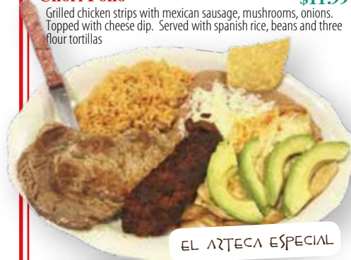
EL AZTECA ESPECIAL